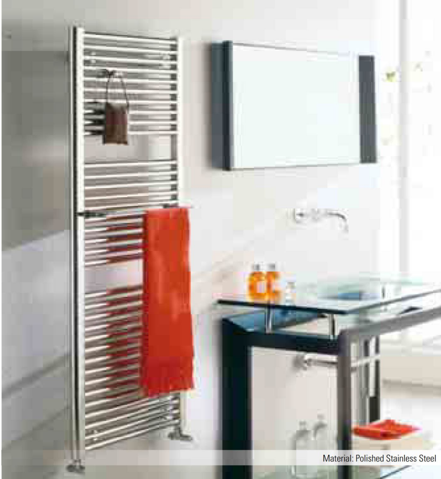
Material: Polished Stainless Steel